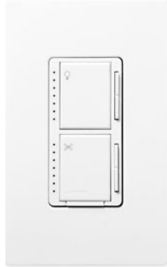
Maestro Fan/Light Control